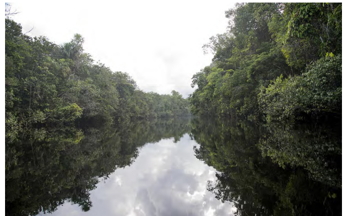
Figure 4. Ichum River (Ichum, Bolívar state, Venezuela) surrounded by riparian forest.

While in the process of this investigation, three additional specimens of B. dominans were found from French Guiana. They are all females; the first one captured at night, close to a light, in December 1989 in Bélizón trail, going to Regina road, French Guiana (Figure 3). The other two females were collected with the use of a Glass Interception Trap located some 50 cm above ground, in