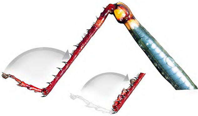
Figure 7. Internal view of hind leg of a specimen of Bactrophora dominans from Tepui Ichum, Venezuela, showing colors of femur (distal end), tibia and tarsus. The view of the leg shows how the tarsus moves to fold into the tibia. The inset shows the tarsus completely folded into the tibia, whose apical spines are clearly shown once the tarsus is folded.