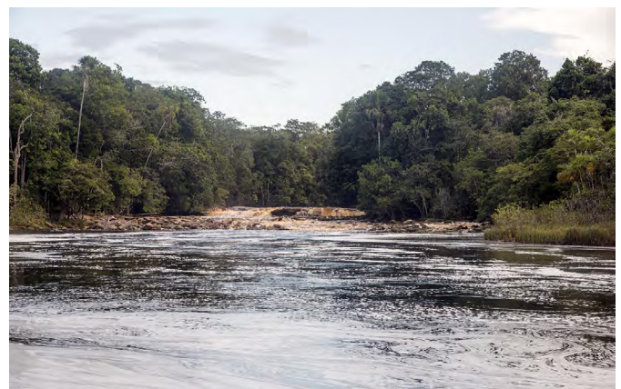
Figure 5. Ichum River (Ichum Tepui, Bolívar state, Venezuela). Waterfalls 1 km up river from collecting site of the Venezuelan specimen of Bactrophora dominans .