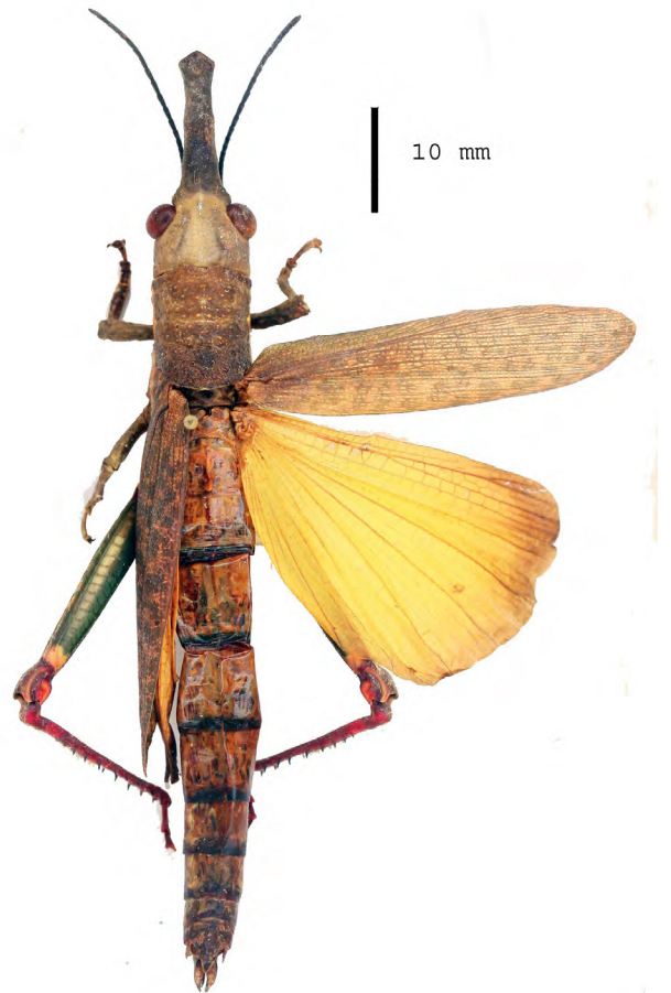
Figure 6. Mounted female Bactrophora dominans from Bélizon (Bélizon trail, French Guiana). Scale: 10 mm.

Detailed measurements were taken of two B. dominans specimens: Female 1 (from Tepui Ichum, Venezuela) (Figures 1 and 2): Length of body, including fastigium: 74 mm; length of fastigium: 12 mm; dorsal length of entire head: 17 mm; length of pronotum: 10 mm; greatest width of pronotum: 10 mm; length of tegmen: 38 mm; greatest width of tegmen: 9 mm; length of hindwing: 35 mm;