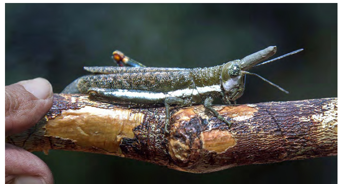
Figure 1. Bactrophora dominans from Ichum, Bolívar state, Venezuela, walking on a stick placed in front on a raft. Fingers of collector are placed as reference scale.